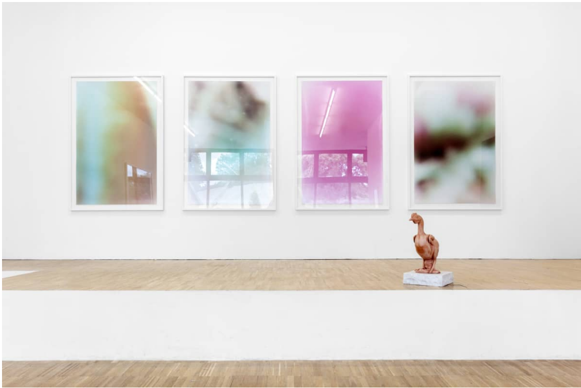
Smog , 2015 Kunsthhaus, Jetesberg