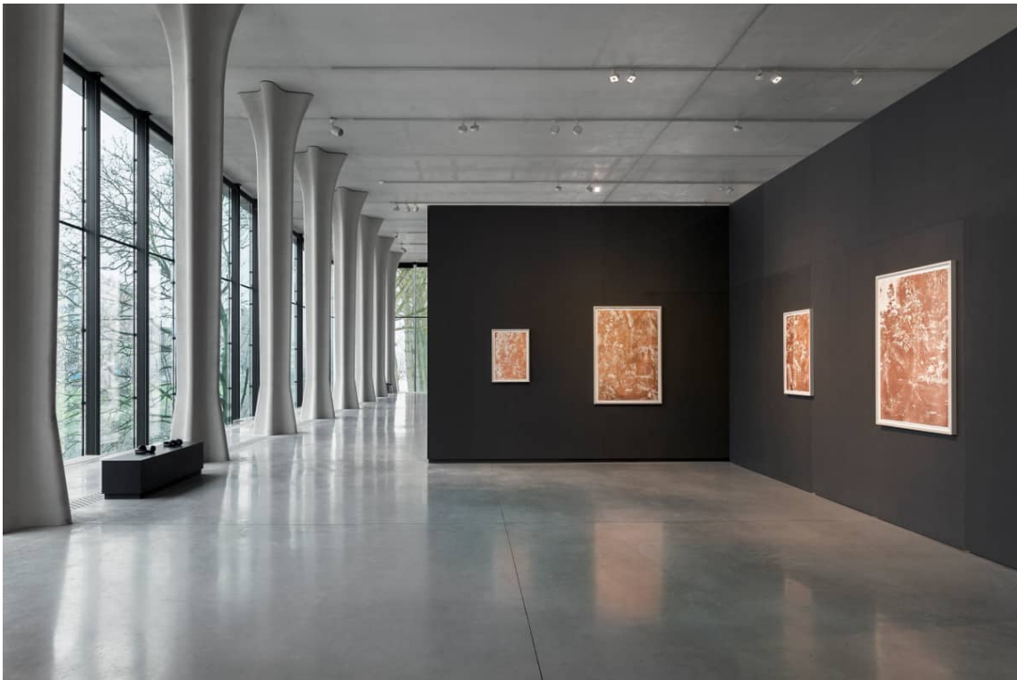
Fluo Noir , 2018 La Boverie, Liège