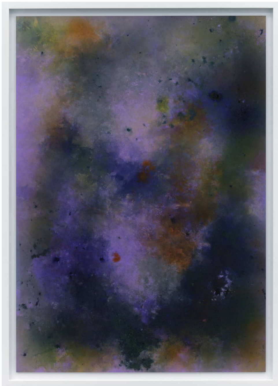
Mono no Aware (Multicolour on Purple) 2018

colored smoke on paper 108 x 78 x 4 cm (image : 100 x 70 cm) unique