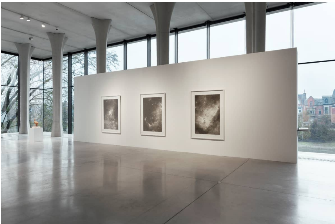
Fluo Noir , 2018 La Boverie, Liège