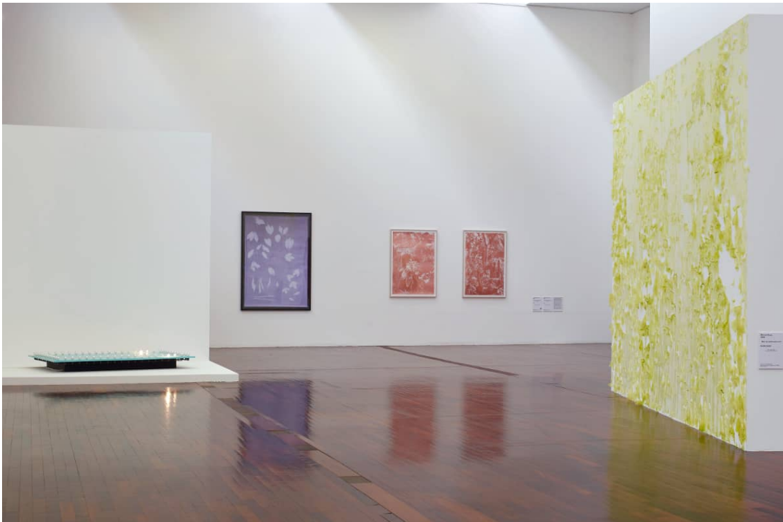
Le vent se lève, 2020 MAC VAL, Paris