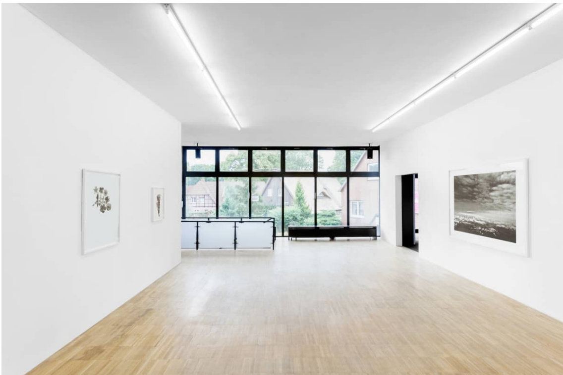
Smog , 2015 Kunsthhaus, Jetesberg