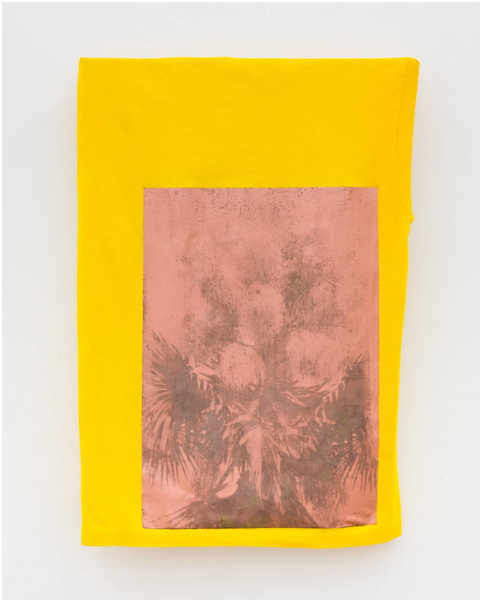
Corypha Taliera on Yellow T-Shirt 2022

copper, recycled silver salts, varnish on fabric 67 x 45 x 12 cm unique