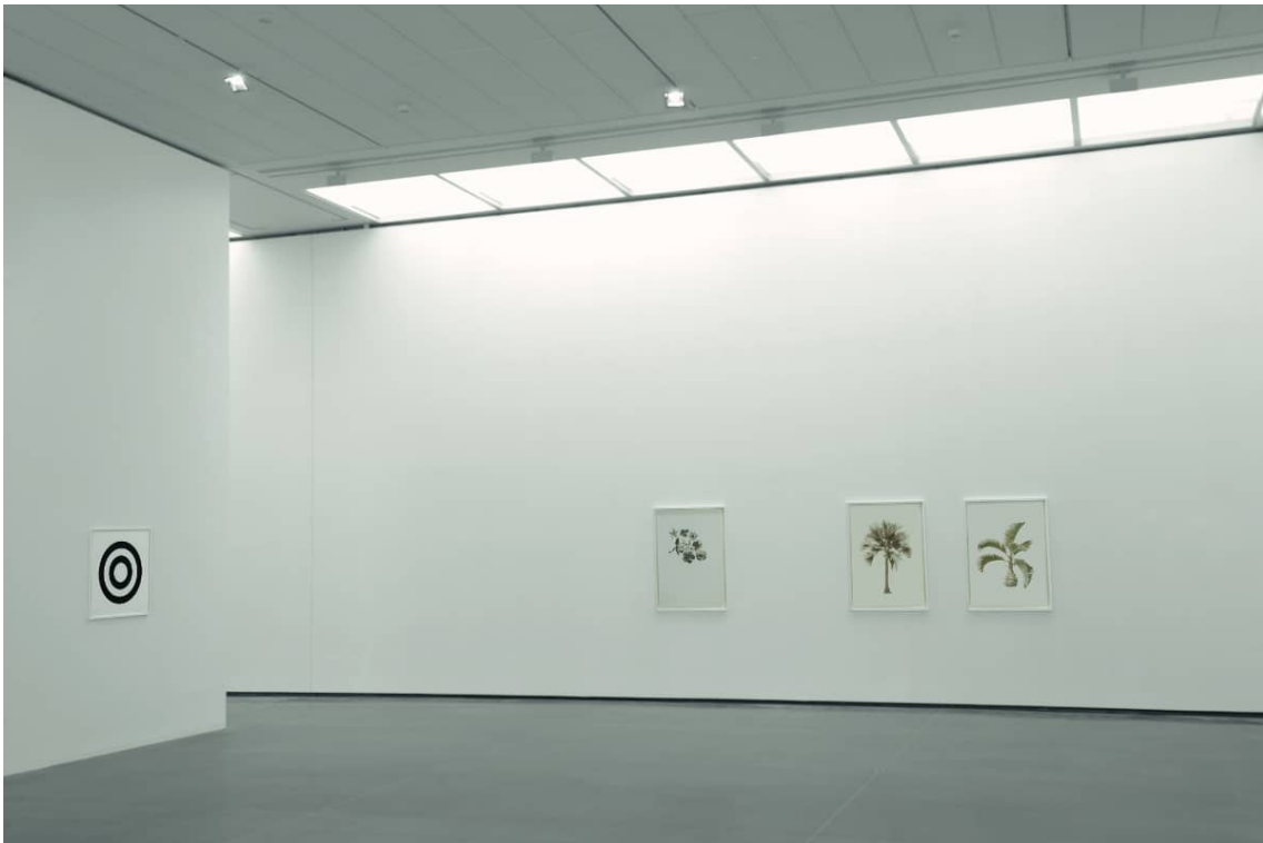
Corrélation, 2012 Musée des Beaux-Arts d'Angers