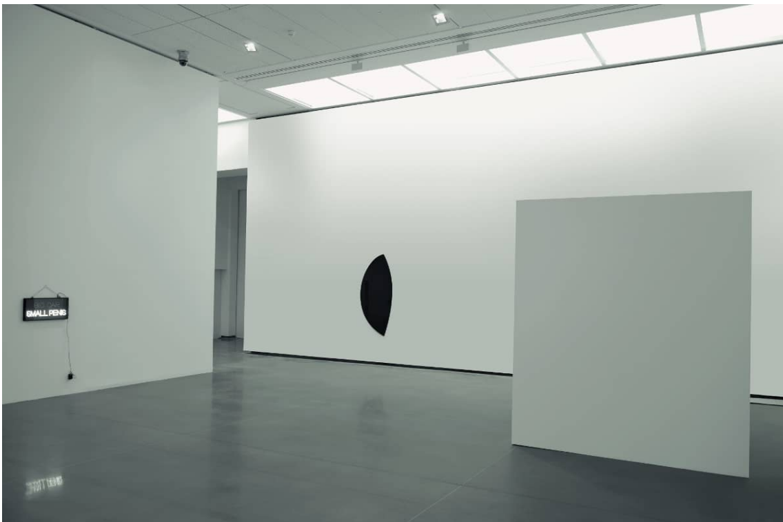
Corrélation, 2012 Musée des Beaux-Arts d'Angers