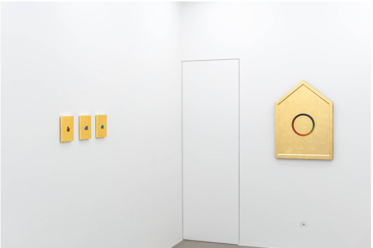
Thesaurus 7 March > 4 April 2026